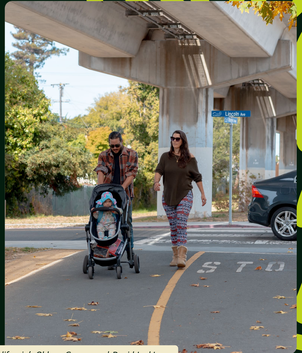
California's Ohlone Greenway

RAILS TO Learn more Trails railstotrails.org/funding conservancy