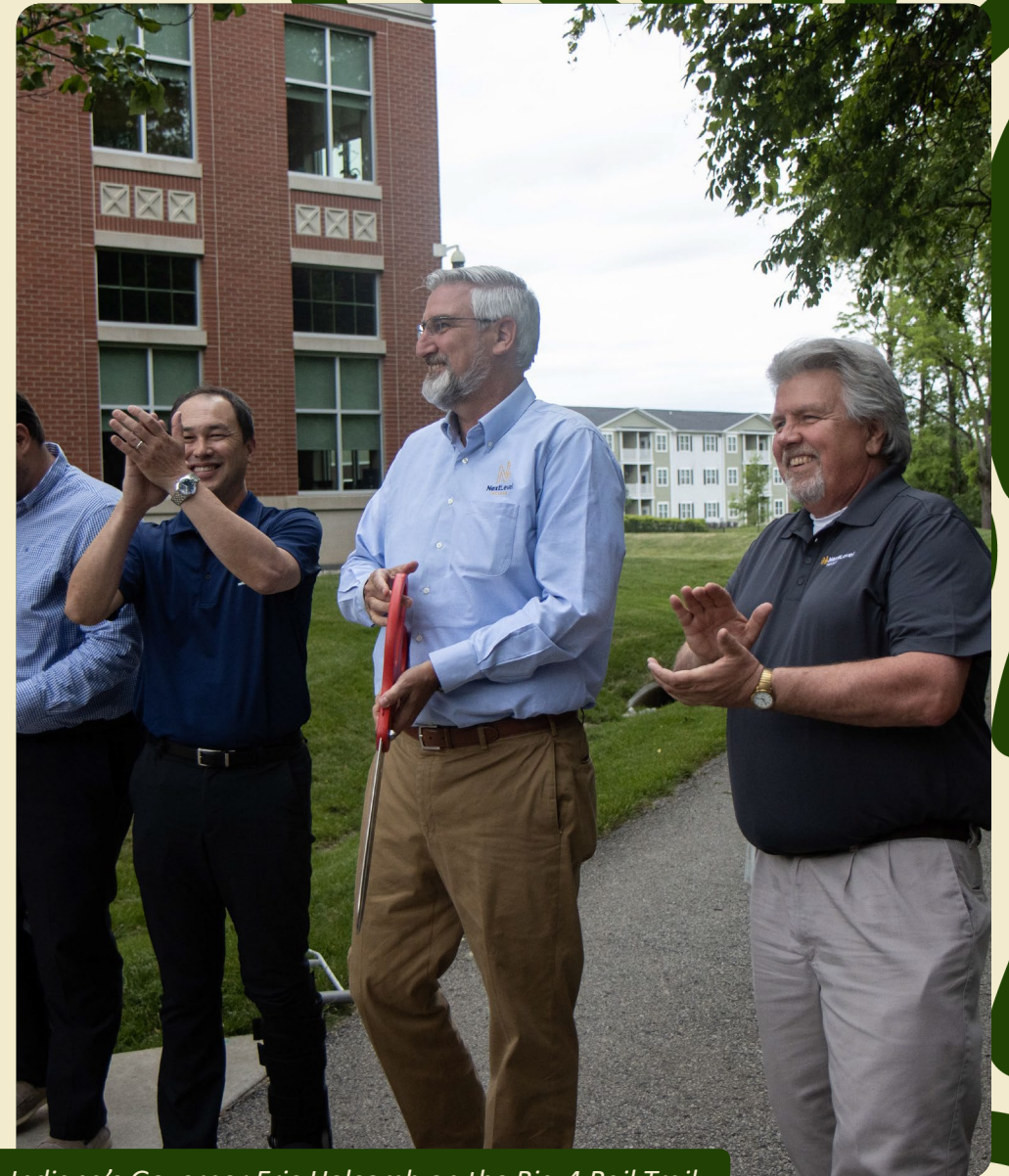
Indiana's Governor Eric Holcomb on the Big-4 Rail Trail