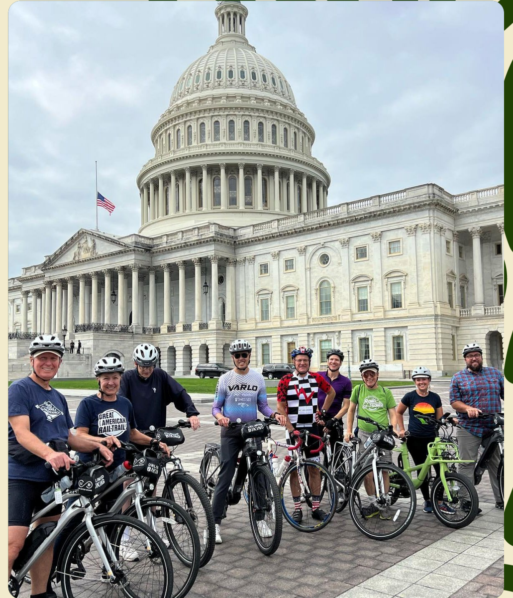
RTC's Board in DC