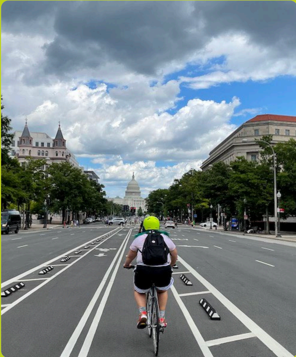
Bike lanes in Washington, D.C.