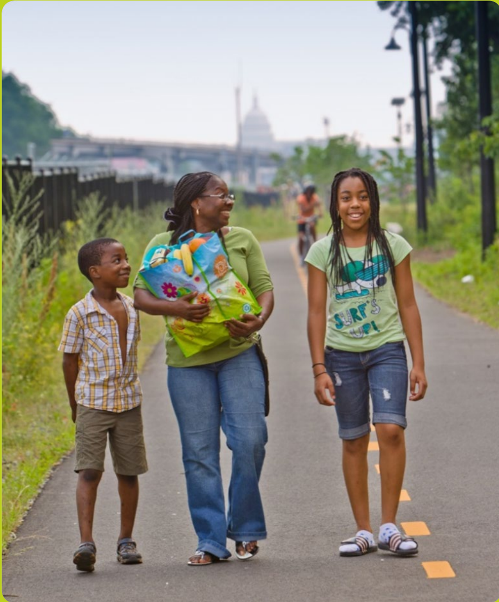
Trail in Washington, D.C.