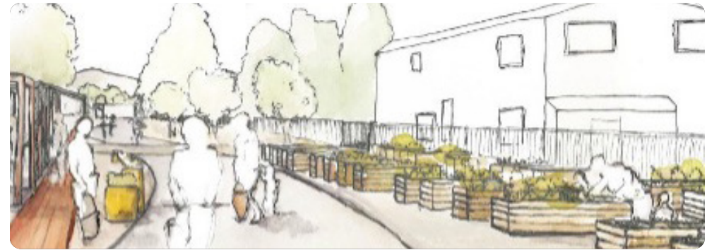
Rendering of proposed food hub between First Street and Second Street along future Richmond Greenway