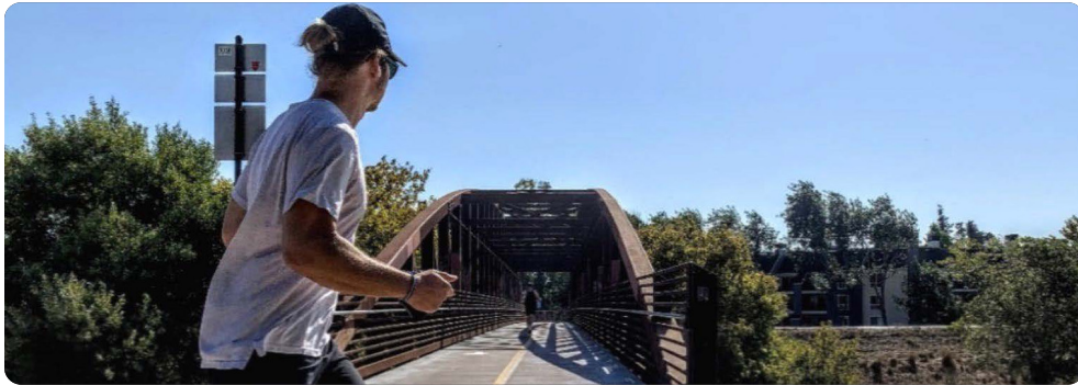
Guadalupe River Trail