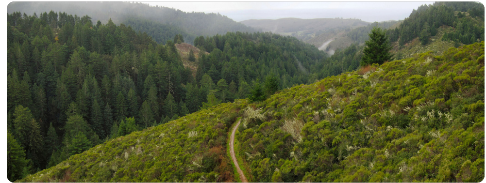
Bay to Sea Trail Corridor | Photo by Miguel Viera