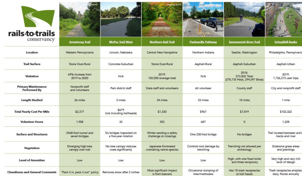
Yearly Routine Rail-Trail Maintenance Costs Per Mile